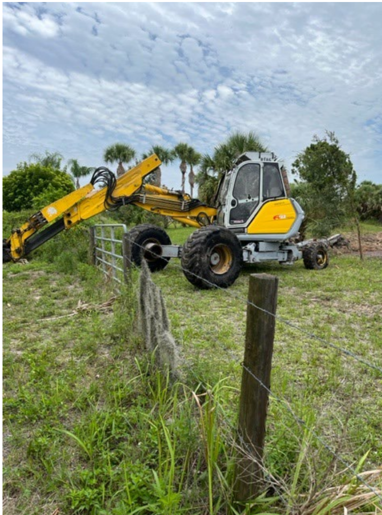
Photo of Menzi Muck, machine used to remove silt buildup within South Creek

Palmer Ranch Master Property Owners Association, Inc. recently contracted the removal of silt from the South Creek Drainage Basin, in areas owned and maintained by the Master Association. For those of you who are not aware, South Creek runs alongside the eastern border of Palmer Ranch and is a main drainage basin for all the communities from The Hampton's all the way down to the Oscar Scherer State Park. A silt removal study completed by Stantec Engineering determined that three areas of South Creek needed to be addressed. The Palmer Ranch Board of Trustees approved the expenditure and work commenced just south of Palmer Ranch Parkway Extension at Honore Avenue within Restoration Area F. From there, work continued to Restoration Area H and finally Restoration Area C.